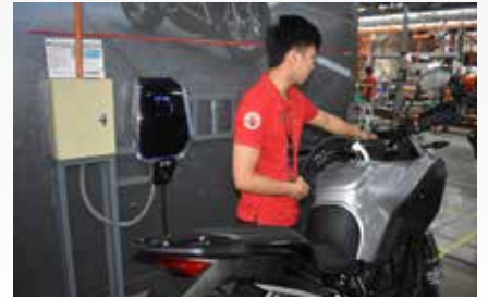
Motorcycle / EV Assembly