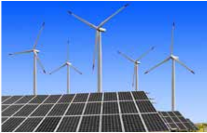
Power Semiconductor Devices