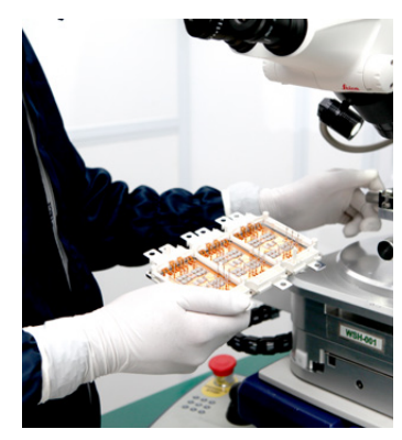
Power Module Assembly