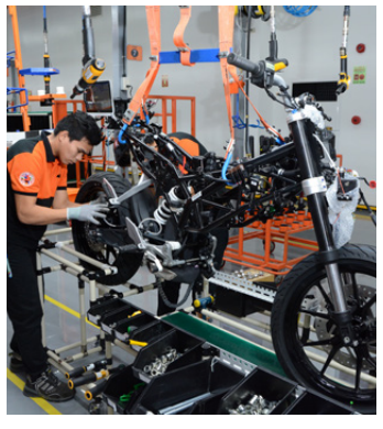
Motorcycle Manufacturing Assembly